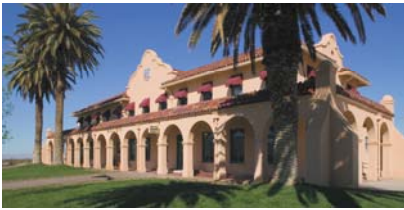
Kelso Depot National Park