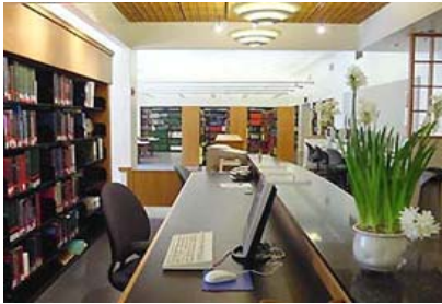
Fong Library, UC Berkeley