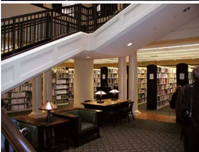
Burlingame Historic Public Library