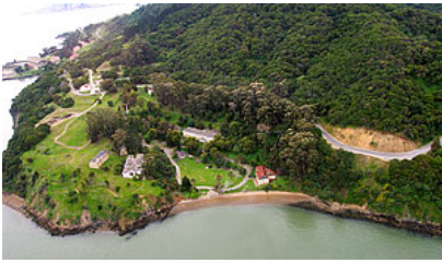
Angel Island Historic Facilities