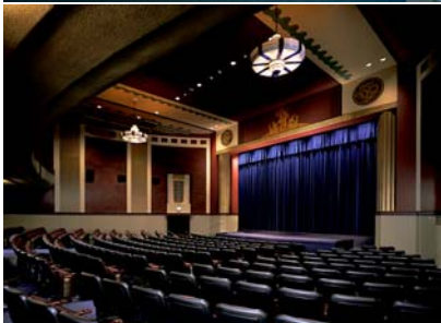
Rafael Theater & Film Center