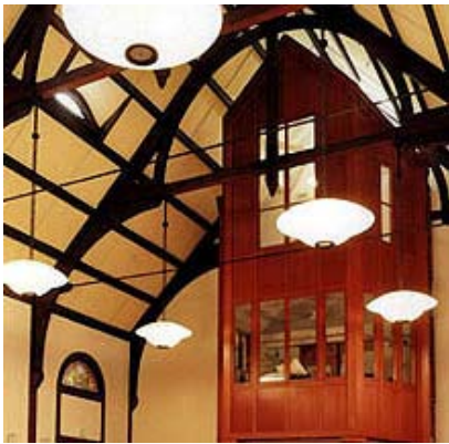
First Unitarian Church of Oakland