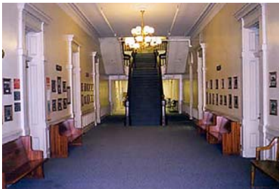
Napa Historic Courthouse