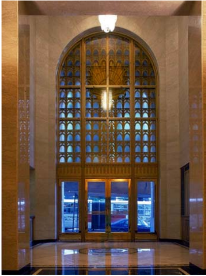
One Bush Street, The Shell Building