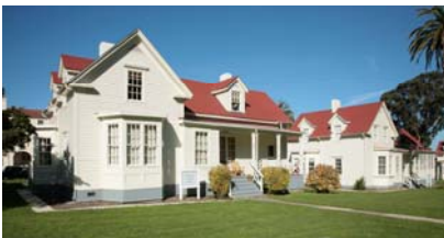
Presidio Funston Bldg #5